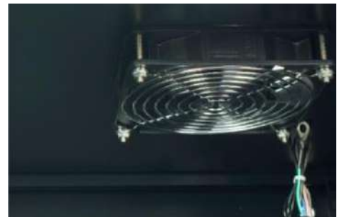
Optional Fan Unit