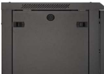
Removable Side Panels (Optional Side Locks)