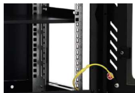
Zinc plated mounting profile