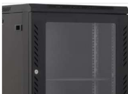
Tempered front glass door with metal perforated border