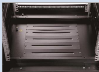
Cable entrance on rear panel