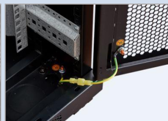
Ground wire optional