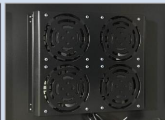
Fan group optional