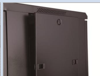
Removable side panels (Side lock optional)